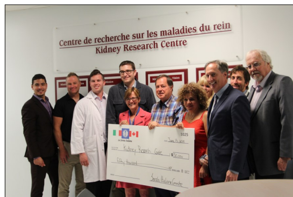
Photo: Members of the KRC staff and La Serata Italiana organizing committee.